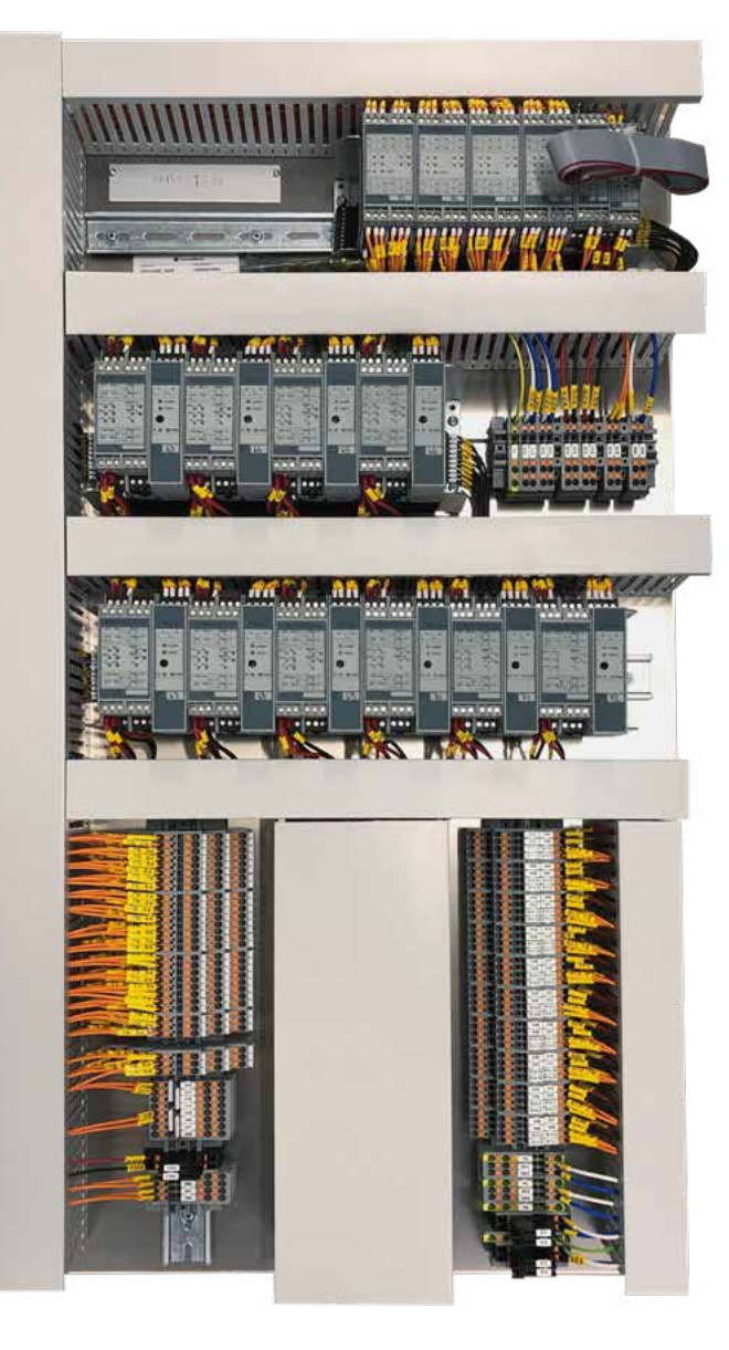
Easy to install. All modules and terminals are mounted on steel plates that fit into the existing cabinet (20U-type). No drilling or modification needed, when replacing a GS3000.

The service engineers in our network are very familiar with CGD500. They make sure you get a professional installation, and we give you a one-year warranty on the new system.