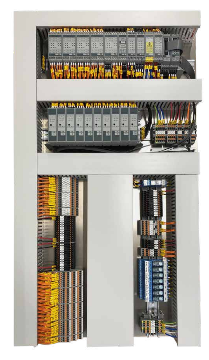
Easy to install. All modules and terminals are mounted on steel plates that fit into the existing cabinet (20U-type). No drilling or modification needed, when replacing a CS3000.

The service engineers in our network are very familiar with CFD500. They make sure you get a professional installation, and we give you a one-year warranty on the new system.